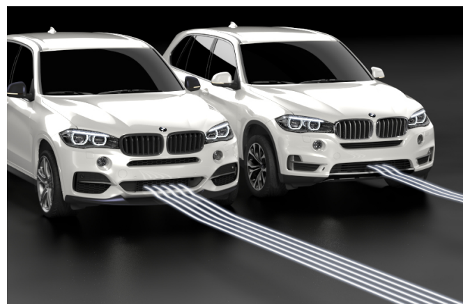
M Performance Power Kit with new, performance-optimised engine data update