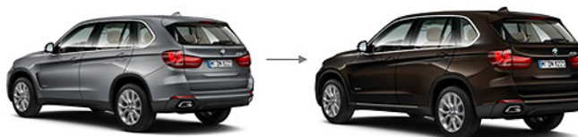
Comparison of X5 without and with aluminium foot board retrofit kit