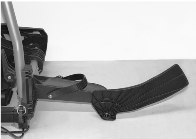
Exhaust heat shield